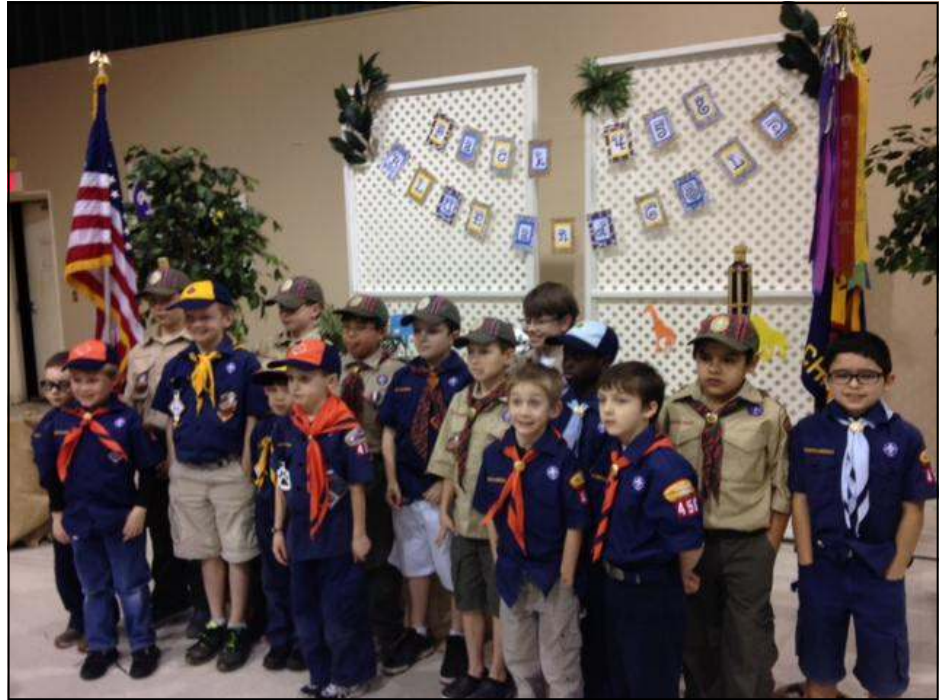
The Scouts had their Annual Blue & Gold Banquet on Saturday, Feb. 22nd